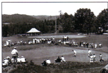
Gallery watches action during 1927 Eastern Open.